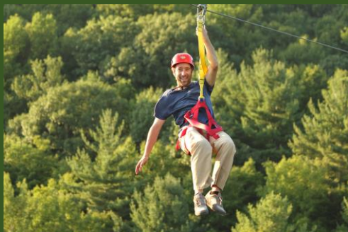
Zip lining at Berkshire East.

Berkshire East Ski Area now receives more revenue in the summer than during the ski season according to owner Jon Schaefer. This success is a result of investments made to the business since 2008, including: a mountain bike park -- ranked best mountain bike park on the East coast; three zip line tours; an aerial adventure park; white water rafting; and a mountain coaster. Schaefer noted that the region is accessible to a lot of people in nearby metro areas, but has just been overlooked. Marketing is very important, and with coordinated efforts, the region could pull in much more tourism revenue.